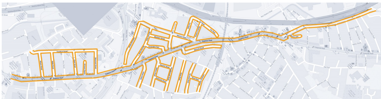
Figure 1 Project Area (highlighted)

BWC is proposing to remove all of the 1280ltr (euro bins) communal refuse bins from all 3 sections of Stapleton Road and 34 surrounding streets. The following map (Figure 1) illustrates the area that is being considered within this project.